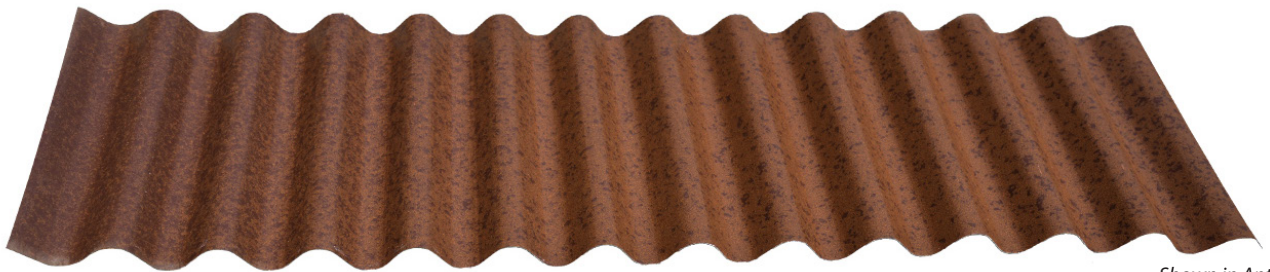
Shown in Antique Rustic®

*Limited warranty. Please review prior to purchase.