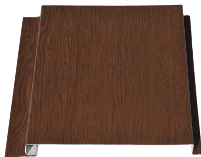
Walnut Wood - Pattern B