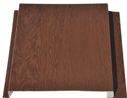
Walnut Wood - Pattern D