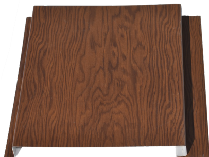
Walnut Wood - Pattern A