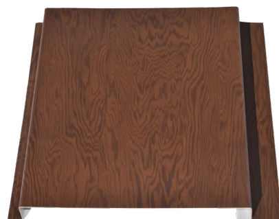
Walnut Wood - Pattern C