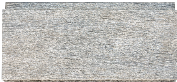
Distressed Wood® - Pattern D