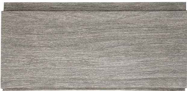
Distressed Wood® - Pattern C