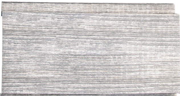
Distressed Wood® - Pattern B