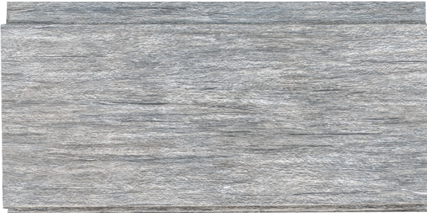
Distressed Wood® - Pattern A