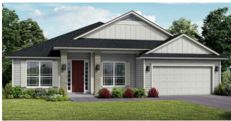
lot 2D-59- Austin C 2,263 sq. ft 3 bedroom, 2 bath, study