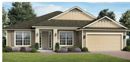
lot 2D-61- Waltham B 2,080 sq. ft 3 bedroom, 2 bath, study 3rd car garage