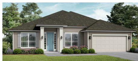
lot 2A-40- Austin A 2,263 sq. ft 3 bedroom, 2 bath, study