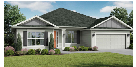
lot 2E-110- Palazzo B 2,112 sq. ft 4 bedroom, 3 bath 3rd car garage (not shown in image)