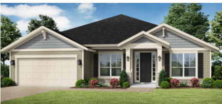
lot 2A-37 -Waltham C 2,080 sq. ft 3 bedroom, 2 bath, study