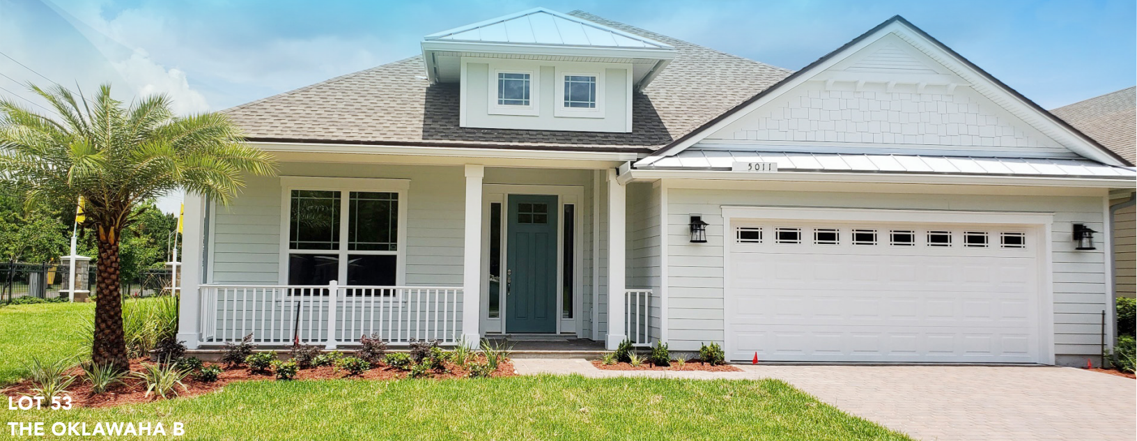
LOT 53 THE OKLAWAHA B