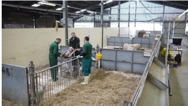
Figure 1. Housing facilities for the trial. Lambs were restrained in a cradle and the prototype device was used to fit the tail with a ring and inject lignocaine at the constriction site. Lambs were then returned their mothers in concrete-floored pens with deep straw bedding.