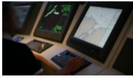
FURUNO ECDIS - Online training €250.00

All Autopilot ECDIS FURUNO Type-Specific Generic IBS / INS Other Short Courses STCW