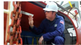
Port State Control, FURUNO ECDIS - Online training €100.00