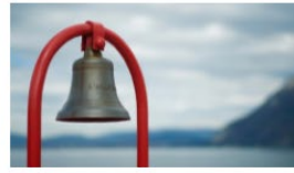
FURUNO ECDIS Alerts - Online training €20.00