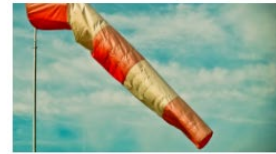
FURUNO ECDIS Sensors - Online training €20.00