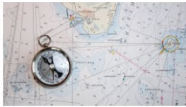
FURUNO ECDIS Chart Handling - Online training €40.00