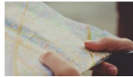
FURUNO ECDIS Route Planning - Online training €40.00