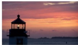
Watchkeeping, FURUNO ECDIS - Online training €20.00