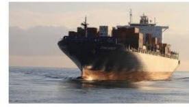
FURUNO Autopilot FAP-3000 - Online training €50.00