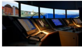
FURUNO ECDIS Refresher - Online training €180.00