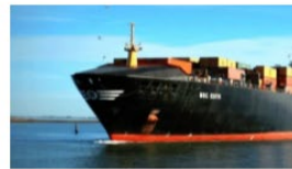
FURUNO ECDIS Tools - Online training €20.00