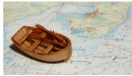
FURUNO ECDIS Chart Display - Online training €40.00