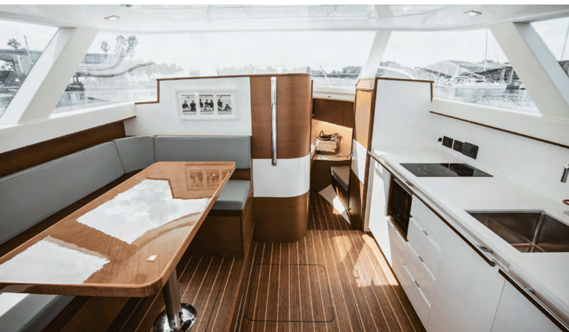
Gray interior package shown above.