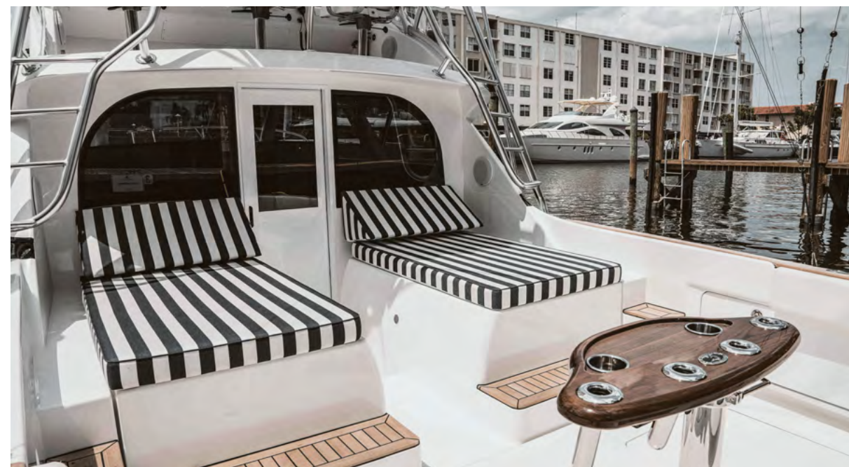
Blue and white exterior upholstery package shown above.