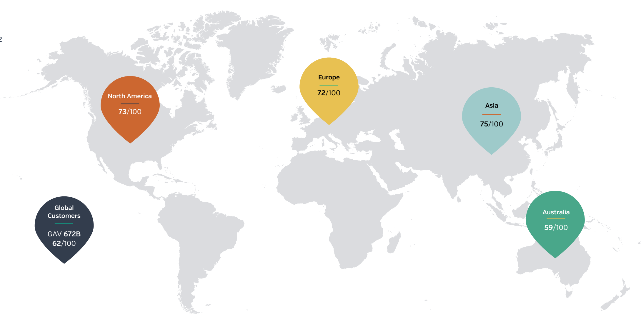
Average Score by Region