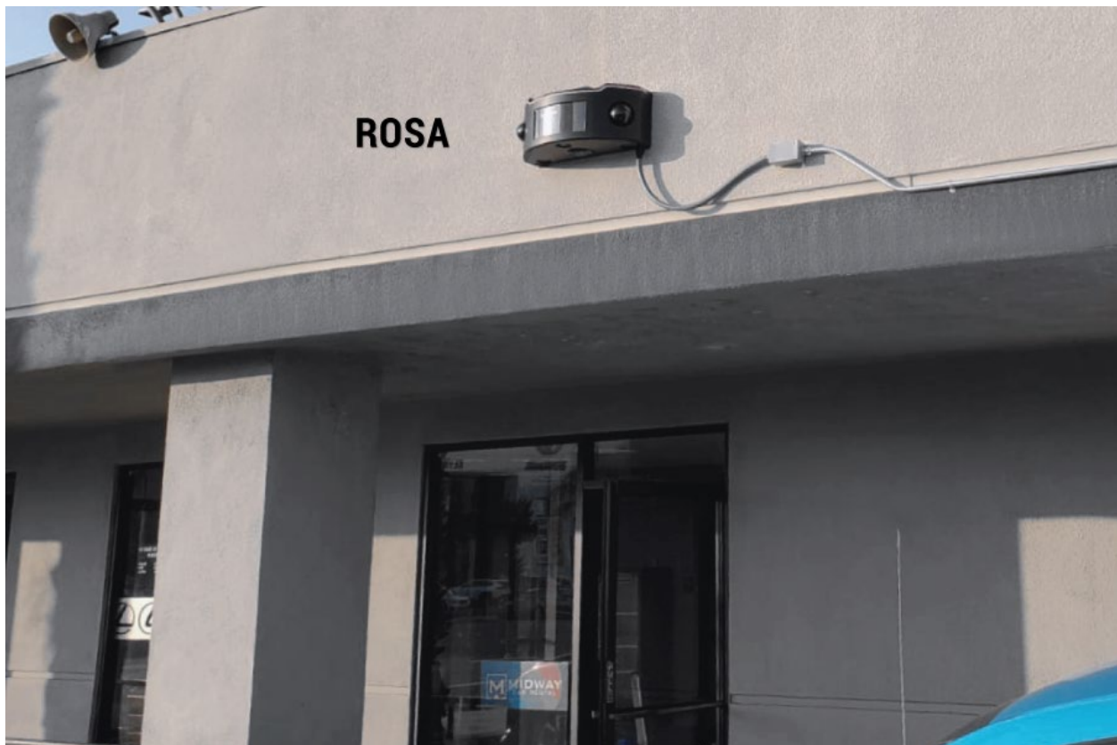
ROSA at Midway Car Rental

The system's scalability and flexibility ensure that Midway's investment will continue to pay dividends. Perez says, "We're growing so fast, we're trying to put flagpoles in the markets where we identify a need, but that doesn't mean we're locking ourselves into long-term leases. Down the road, if we decide to move locations, our ROSAs move with us. We heavily factored their ability to easily install, uninstall, and re-install when deciding to go with this technology."