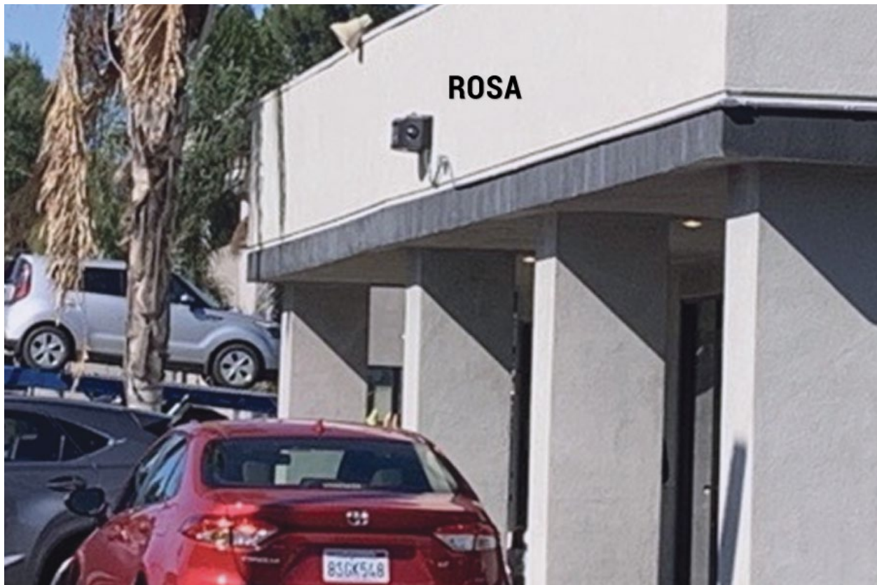
RAD's ROSA positioned at Midway Car Rental