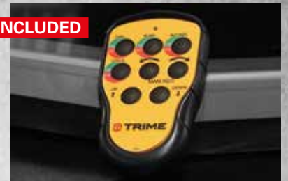
R.O.T. SYSTEM Remote Control 50mt range