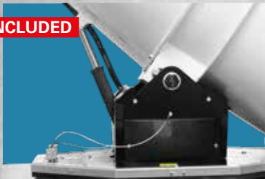
R.O.T. SYSTEM Electric Tilting System