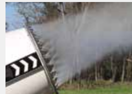
Stainless steel crown with 36 NOZZLES