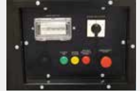
Integrated CONTROL PANEL