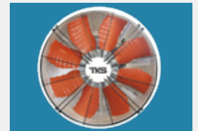
FAN diameter 900mm