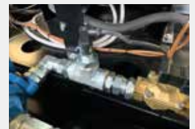
Safety PRESSURE SWITCH