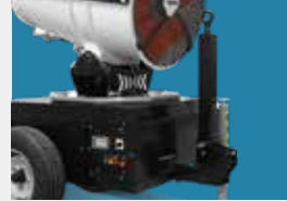
FOLDABLE TOWBAR 35% yard and loading save