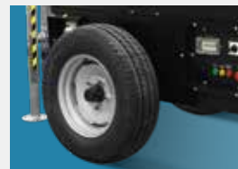
Bigger size WHEELS for off-road sites