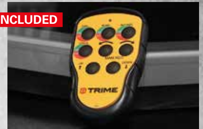
R.O.T. SYSTEM Remote Control 50mt range