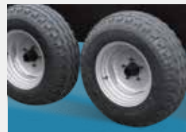
Bigger size WHEELS for off-road sites