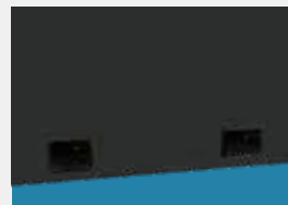
Mounted on BASE with forklift pockets