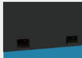
Mounted on BASE with forklift pockets