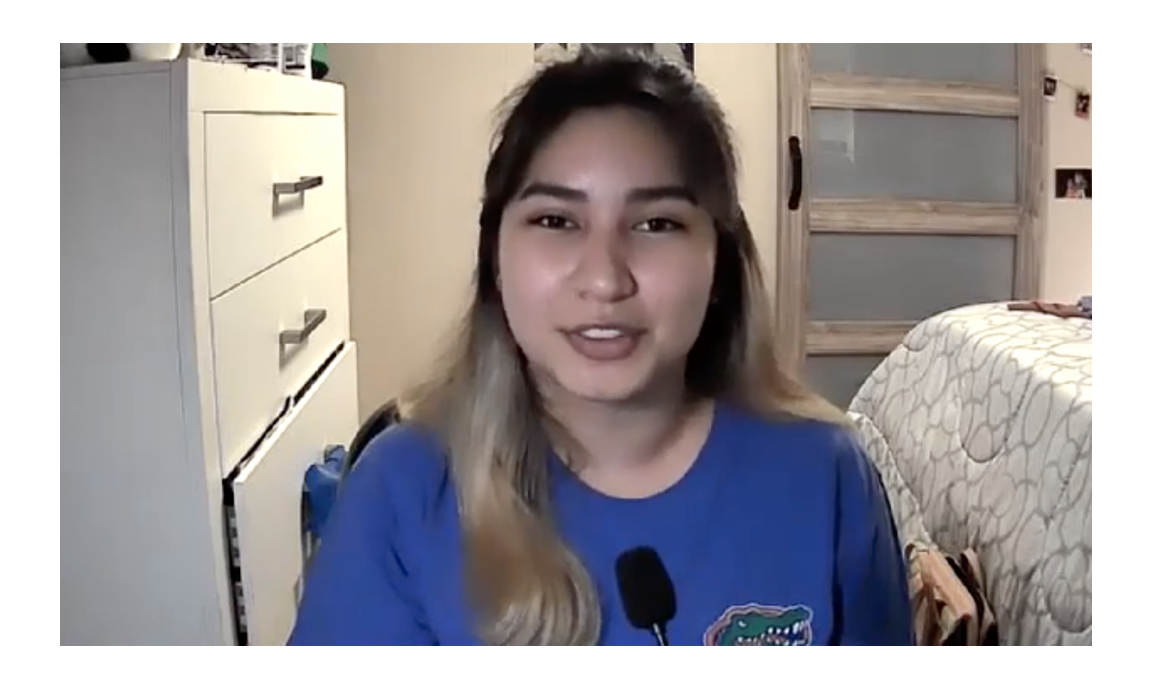
View the full video at: knack.to/alyssa