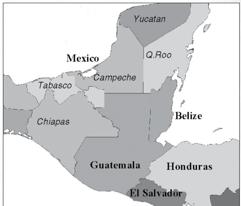
At its peak, the Mayan Empire covered about 37,000 square miles in southern Mexico and Central America.

population grew, they set down roots. They began constructing vast cities of stone with tall pyramids that had steep stairs leading up the sides to the top where powerful rulers were laid to rest. Some of these pyramids still stand today. They also built palaces for their kuhul ajaw or holy lords that were often situated on elevated stone platforms to keep them safe from seasonal flood waters. While the Maya were once considered a peaceful people, it is now believed that they were anything but. The inscriptions on the stonework they left behind show that the Maya went to war with their neighbors often, fighting not only to protect their cities, but for the prestige of victory and to take prisoners who became their slaves. Despite those bloody battles, the Mayan empire thrived for nearly 2,000 years.