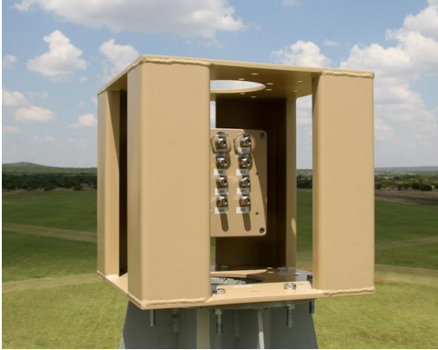
Also showing installed MISC-A0045