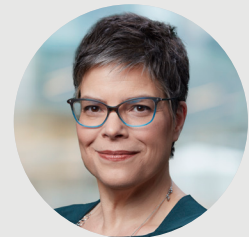
Janet Salm Strada Institute