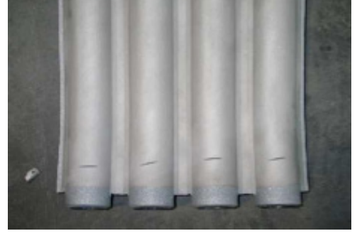
Figure 3: Colmonoy coated Super heater element for a WtE plant in the UK, coated boiler wall panel [2]