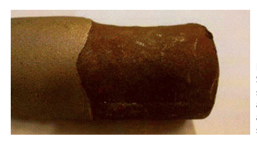
Figure 5: Super heater tube showing coated and uncoated areas after 8000h service (2)

No two boilers have identical operating conditions; and therefore, it is important to understand the characteristics of the system and the type of waste being burnt. It is possible, and indeed likely, that a change in the type of waste burnt could significantly influence the issues seen within the boiler. For example, an increased proportion of plastics within the waste could lead to increased corrosion problems within the boiler. Figure 5 shows a super heater tube after 8000 hours service; the uncoated area has experienced significant material loss.