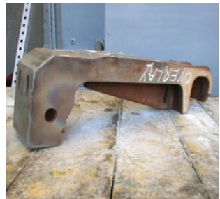
Figure 6: Colmonoy 88 coated side plates and grate bar casting