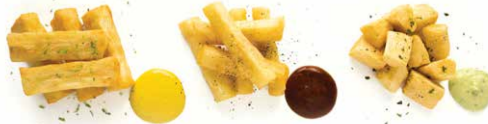
Shown above: Yuca Steak Fries / Yuca Thin Fries / Yuca Croutons