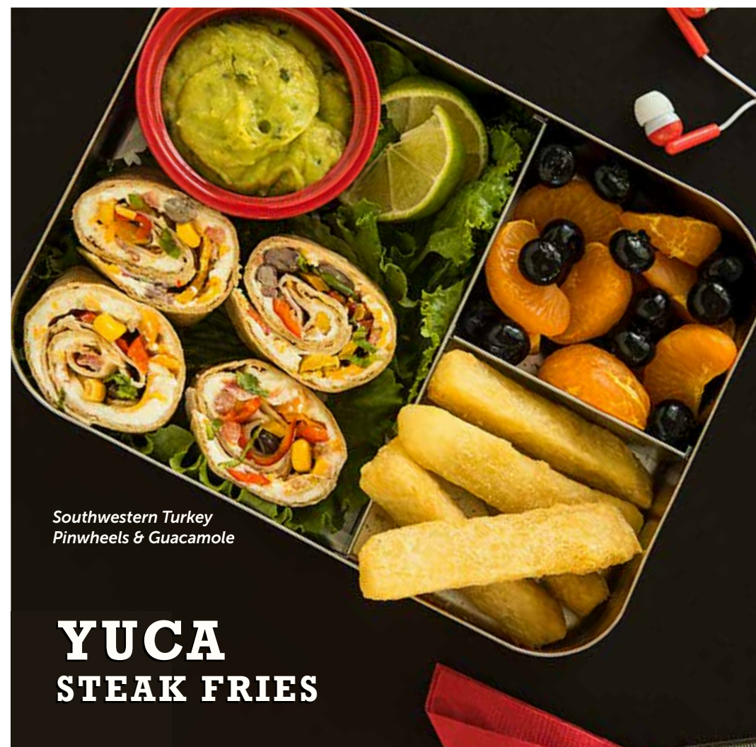
Southwestern Turkey Pinwheels & Guacamole