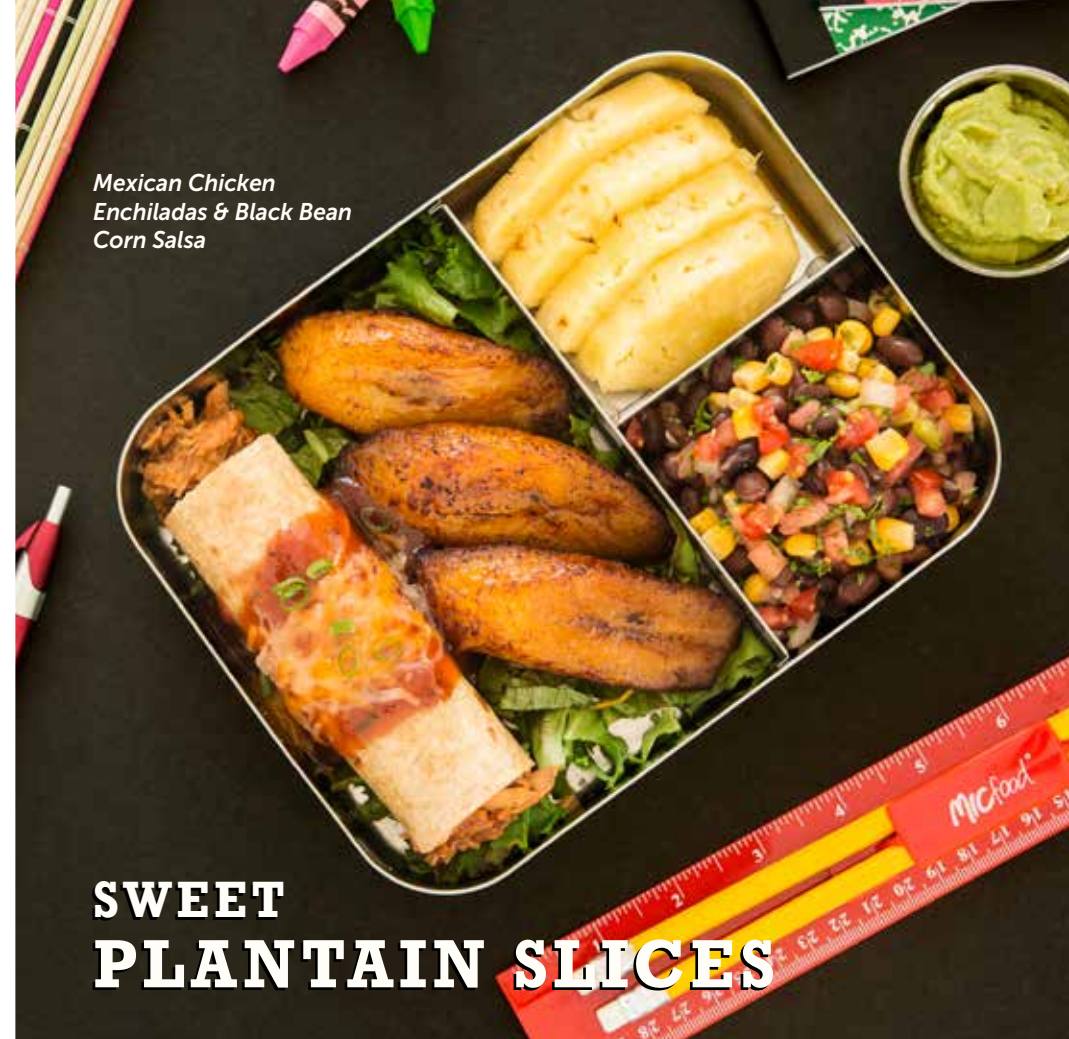
Mexican Chicken Enchiladas & Black Bean Corn Salsa