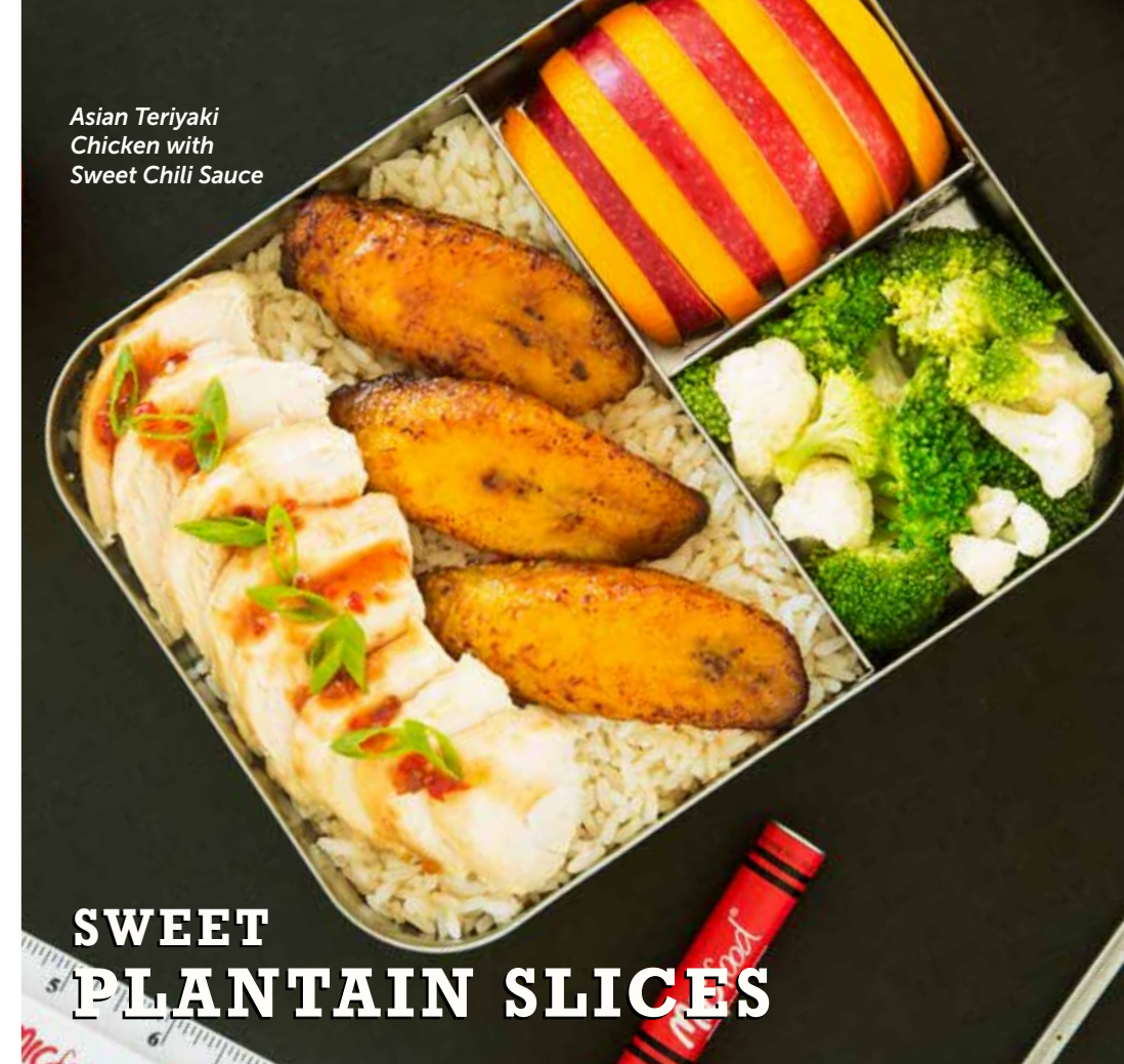
Asian Teriyaki Chicken with Sweet Chili Sauce