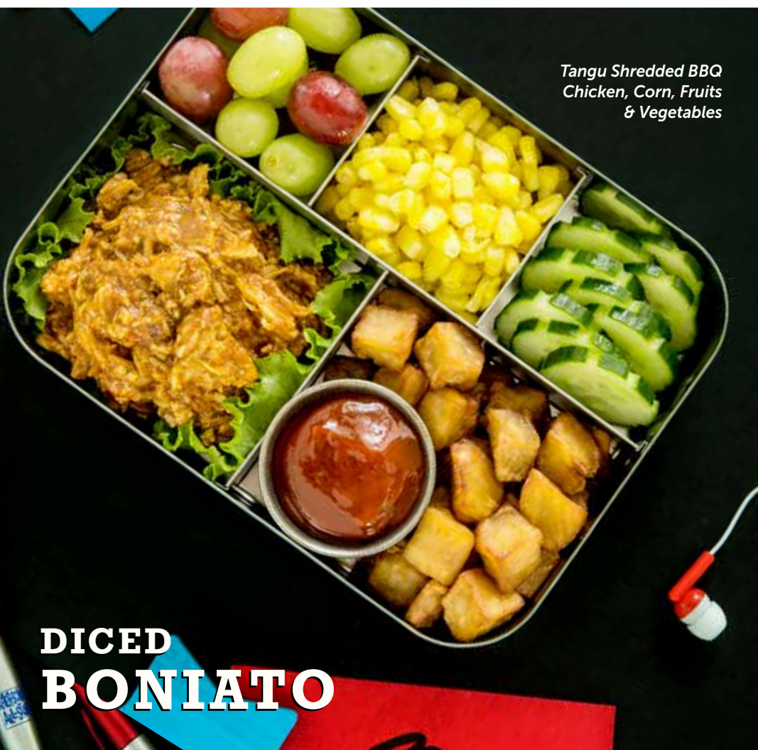
Tangu Shredded BBQ Chicken, Corn, Fruits & Vegetables