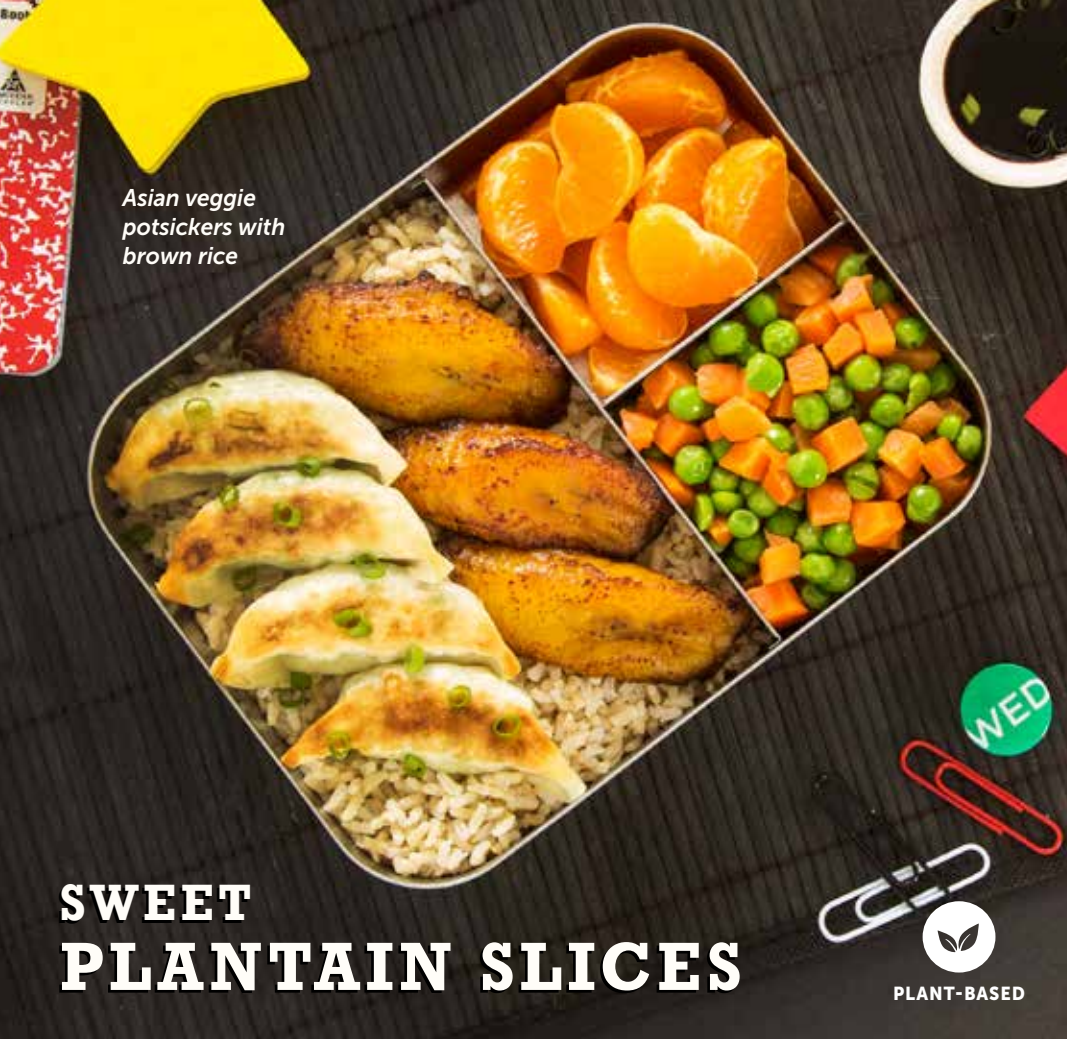
Asian veggie potsickers with brown rice