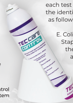
Figure 2. TECcare Control single use misting system

E. Coli; Micrococcus; Bacillus; Proteus; Yeast; Staph Aureus. Using contact slides to report the total number of bacteria on surfaces is a recognised and established method of quantifying the bioburden present on surfaces and to determine how effective cleaning and disinfection processes are at eliminating bacteria from the environment.