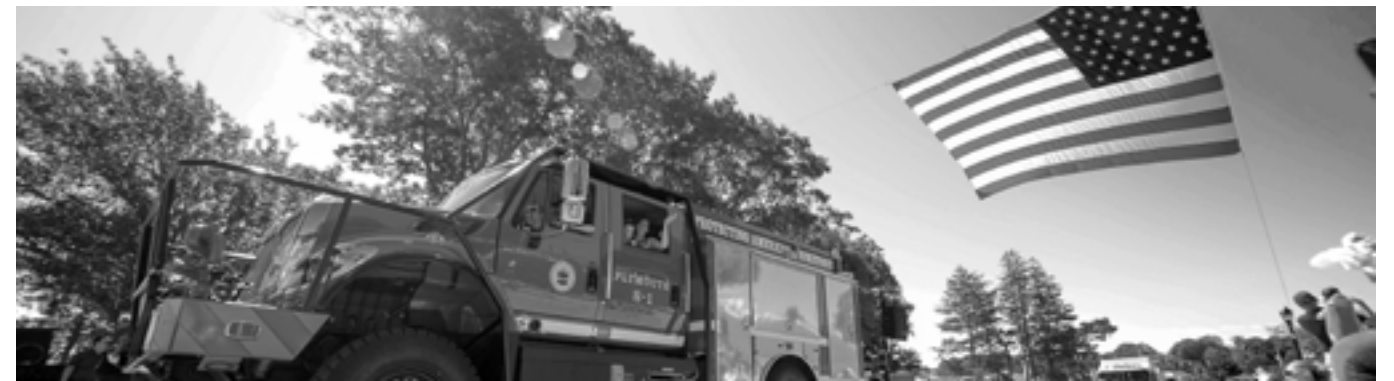
Duxbury & Plymouth 4th of July Parade