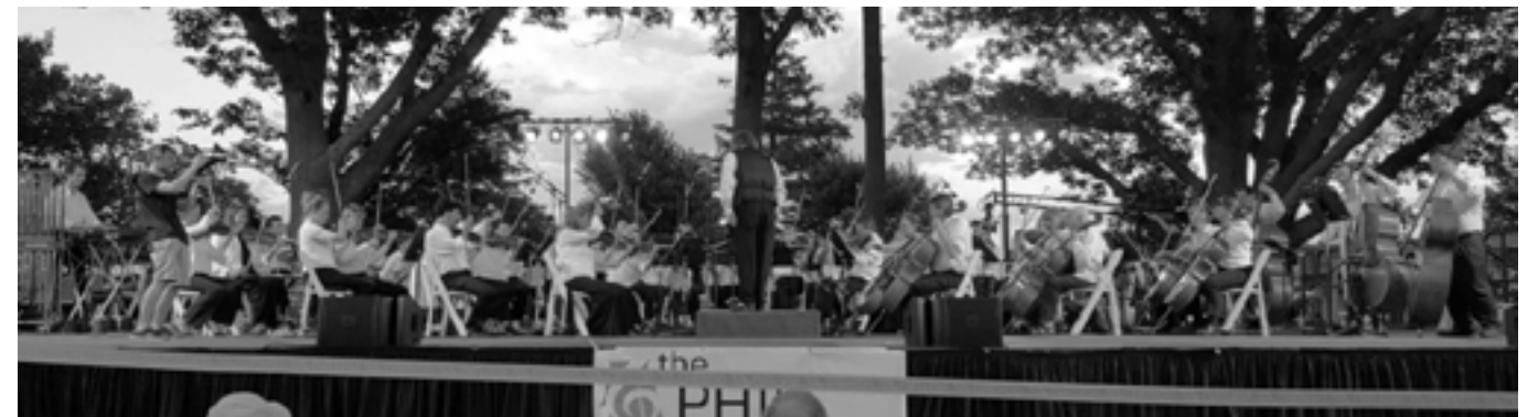
Plymouth 4th of July Celebration Concert with the Plymouth Philharmonic