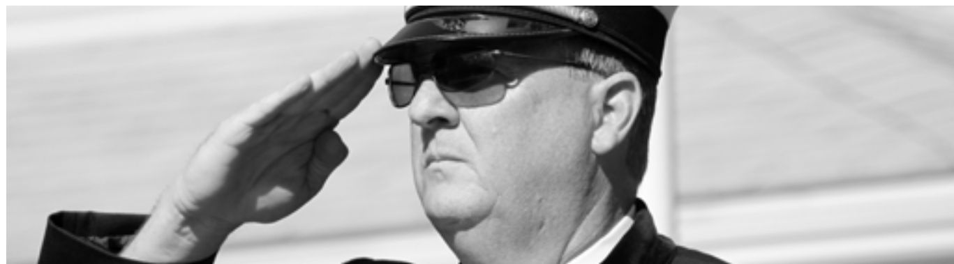
Kingston & Pembroke Memorial Day Parades