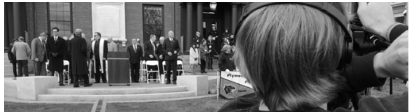
Special Coverage of Plymouth Town Hall Ribbon Cutting

“Thanks for making the Parade available. We aired the parade on @KCRTMedia in the San Francisco Bay Area over Thanksgiving and the weekend. Great job by your staff and crew.”