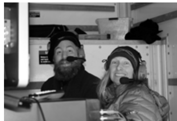
America's Hometown Thanksgiving Celebration Parade

“Thanks for making the Parade available. We aired the parade on @KCRTMedia in the San Francisco Bay Area over Thanksgiving and the weekend. Great job by your staff and crew.”