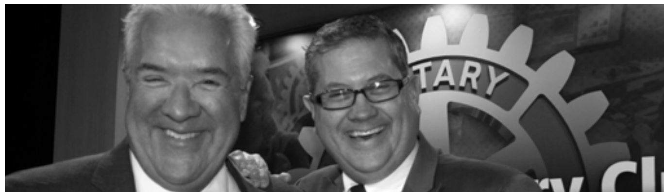
Rotary Club's Annual Auction

PACTV covers a variety of community events each year. Coverage included multi-camera field shoots and recorded events.