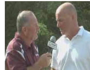
"Video Sports Page"