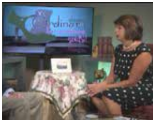
"Ordinary Shoess, Extraordinary Souls"

There was an average of 33 hours per week of first run programming on the channel - that's 1,716 hours in total! Here are a few of our shows created by local producers.