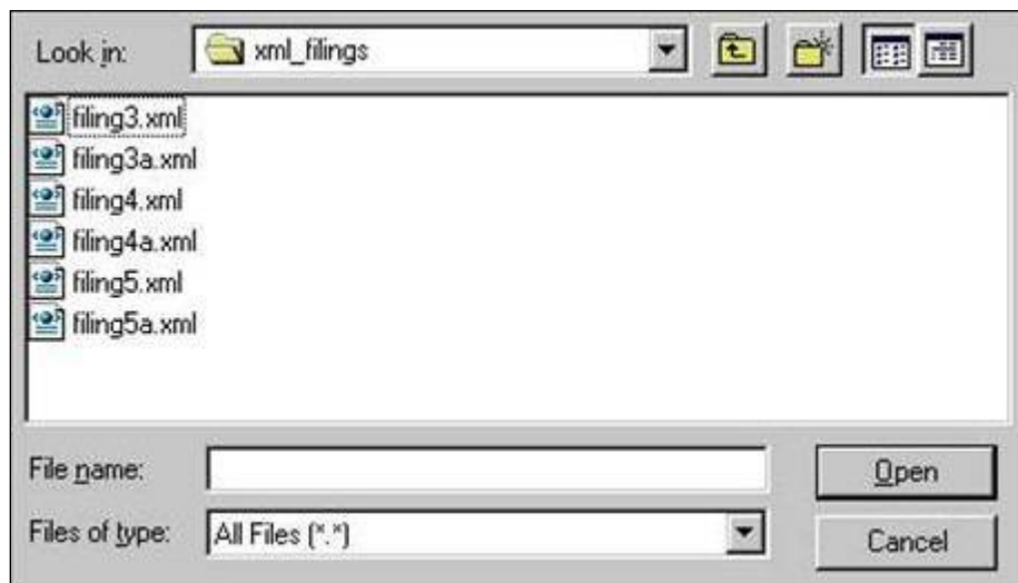
Figure 9-3: Transmit Test Submission File Upload Window

Note: If your XML submission does not appear immediately, change the Files of Type to All Files (*.*)