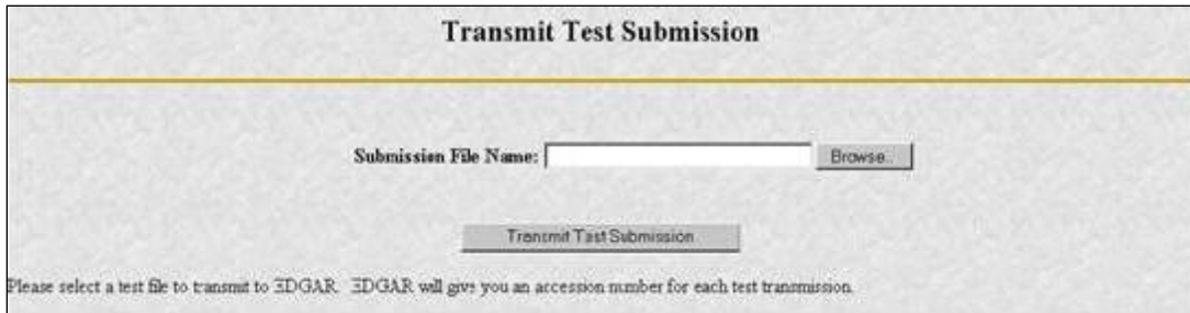
Figure 9-2: Transmit Test Submission Page