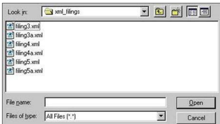
Figure 9-5: Transmit Live Submission File Upload Window

Note: If your XML submission does not appear immediately, change the Files of Type to All Files (*.*) .