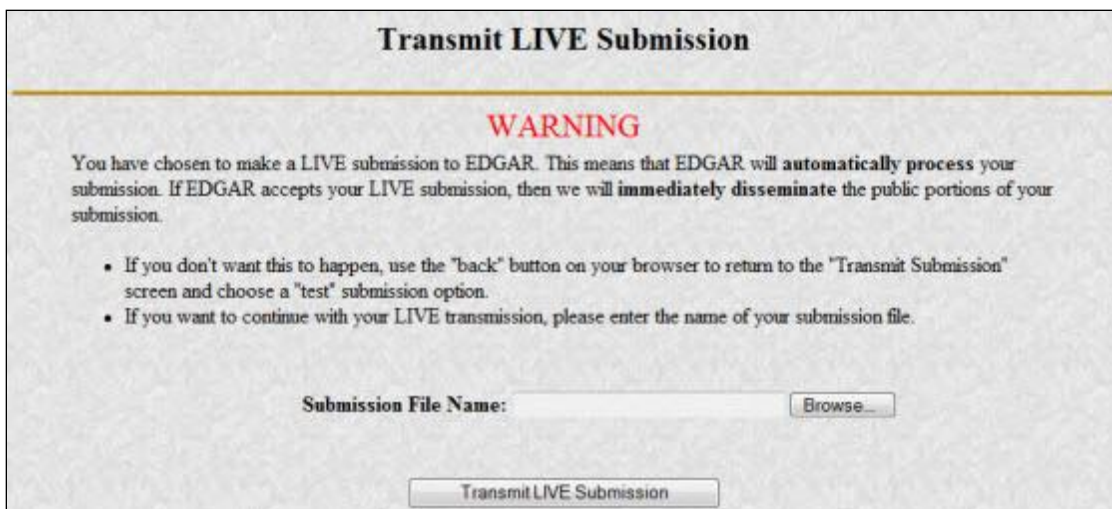
Figure 9-4: Transmit Live Submission Page