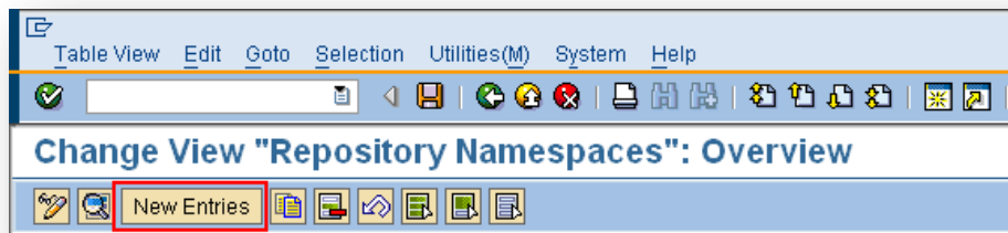
Figure 2: Create a new Namespace