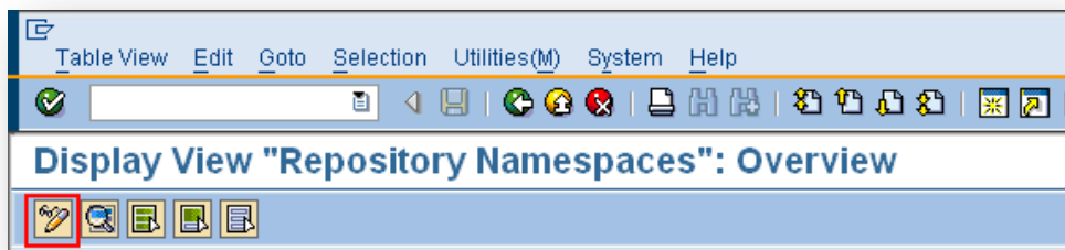
Figure 1: Edit Namespaces

The Repair License is: 00779797301552259874