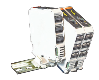
Modulus DI-24 Discrete Input Module