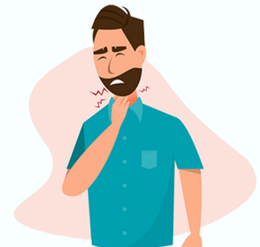
Hard to breathe