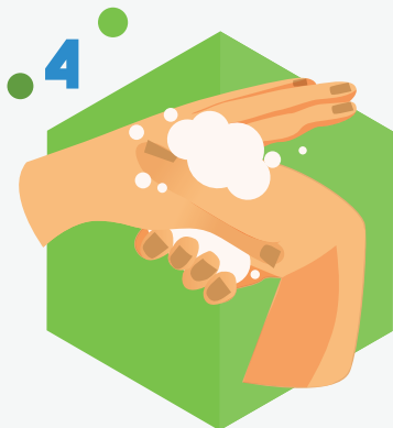
FOCUS ON THUMBS