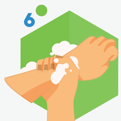
FOCUS ON WRISTS

WASHING YOUR HANDS THOROUGHLY SHOULD TAKE AT LEAST 30 SECONDS