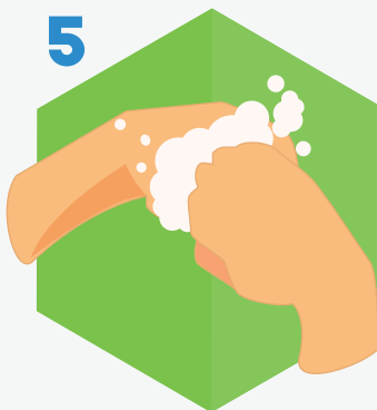
BACK OF HANDS