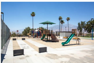
Wardman Park 66150 8th Street 307,850 Sq'