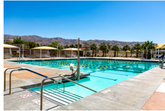
John Furbee Aquatic Center 11750 Cholla Dr 38,775 Sq'