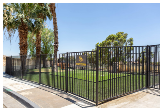
Rotary Dog Park 13598 Don English Way 22,500 Sq'