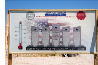
Veteran's Memorial Park 10101 Palm Dr 21,000 Sq'