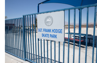
Sgt. Hodge Skate Park 11777 West Dr 18,700 Sq'