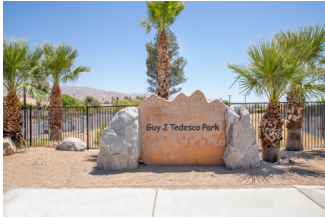
Guy Tedesco Park 12800 West Arroyo Dr 393,625 Sq'