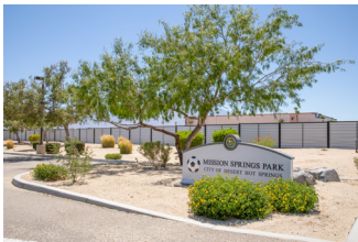
Mission Springs Park 14510 Palm Dr 541,125 Sq'