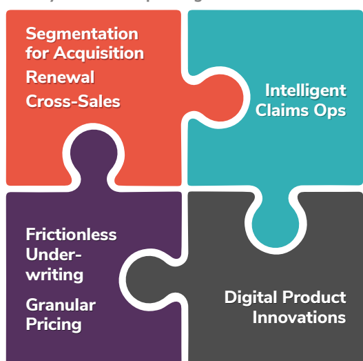
Analytics-Driven Operating Model for Insurance

Tada connects insurance data from sales quotes to policies to claims for 360° visibility across customers, producers, lines of business, coverages, exposure, policies, premiums, pricing, product, claims and geography. This is foundational for decision-making and co-ordination as well as building transformative analytical engines.