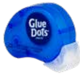
Stitch Glue Squares