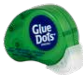
Stitch Glue Squares