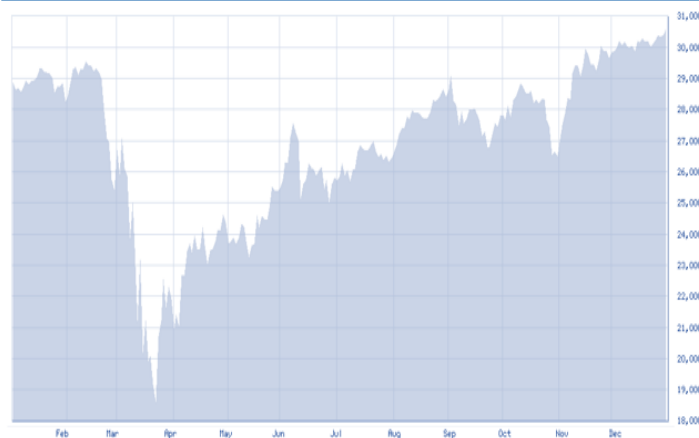
S&P 500 2020