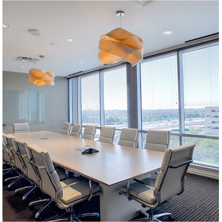
SUITE 360 | 3,847 RSF