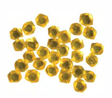
We manufacture high-quality micron diamond & CBN with properties that ensure consistent performance in each application