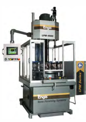
Multi-Stroke Honing, Single-Pass Bore Finishing & Single-Pass Dual Bore Finishing Systems, Complete Machine Design, Tools & Process Development