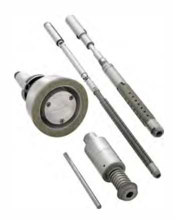
We offer a complete range of superabrasive electroplated products for precision applications.