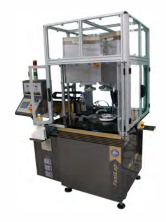
Engis® offers state-of-the-art technology in the design of flat lapping systems that meet the most demanding requirements.