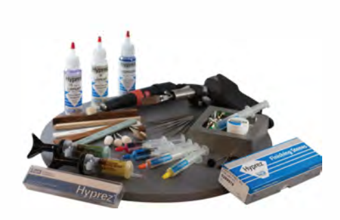
Engis®' long trusted brands include Five-Star® diamond compound.