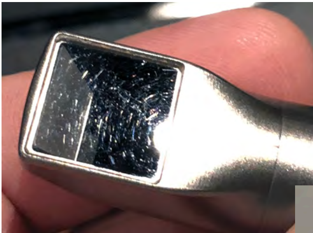
Scatched Surface Before Polishing