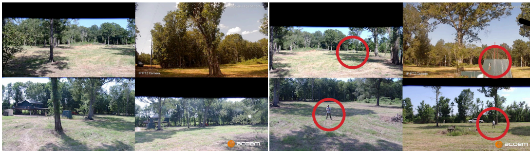
Normal Surveillance from PTZ

Monitor activity and receive rapid alerts to real-time tracking information through your existing access control system. There are no limitations to the number of sensors you can install to ensure no threats go undetected. With a camera attached to every sensor, you'll never respond to a threatening situation blindly. Our agile surveillance cameras have a wide range of motion so that you never lose sight of a threat.