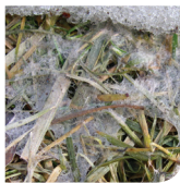
Gray Snow Mold