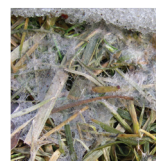
Gray Snow Mold