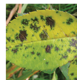
Black Spot on Roses