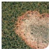
Pink Snow Mold