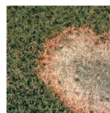
Pink Snow Mold