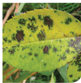
Black Spot on Roses