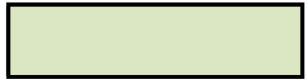
■ Bottom 1 -2 feet of the walls ■ House floor