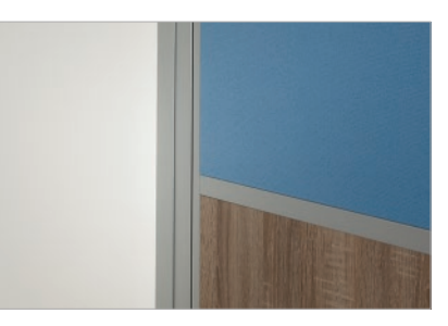
Adjustable Wall Starts provide flexibility to cleanly attach and adjust to walls, columns, and other architectural conditions.