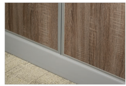
4" Vinyl Base frames the panel and resembles a commercial cove base.