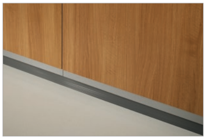
2" Vinyl Base creates a subtle recessed transition to the floor.