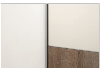
Reveal Wall Starts provide a subtle, recessed wall interface.