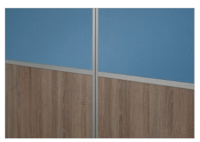
Slim-profile Inserts offer many decorative and functional options.