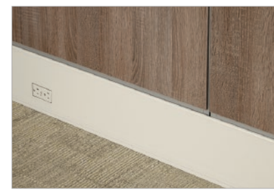
6" Vinyl Base accommodates horizontal modular power.