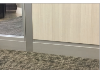
Aluminum Base provides a clean, architectural look.