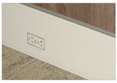
Power and data is distributed and accessed horizontally in the 6" base option.