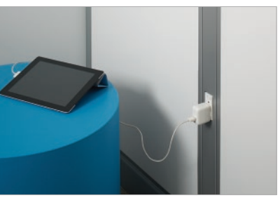
Inline Connectors support power and data vertically for access at multiple heights.