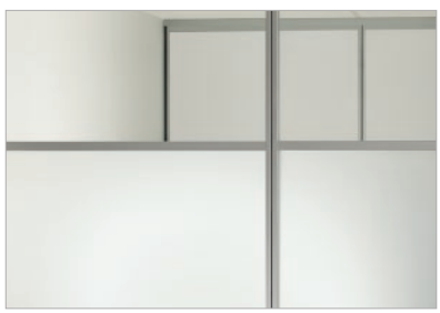
Volo offers Clear, Low Iron, Frost, magnetfriendly, Back Painted glass and writable glazing options.