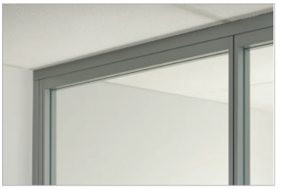
Traditional Crown stands slightly proud of the wall panel. Required for freestanding applications.