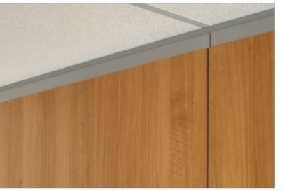
Reveal Crown creates a subtle ceiling attachment transition.