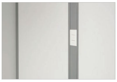
Inline Connectors can be specified with factory-cut openings to accommodate your choice of components.