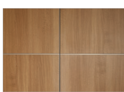
Outserts sit slightly proud of the frame and display a subtle 1/4" reveal.