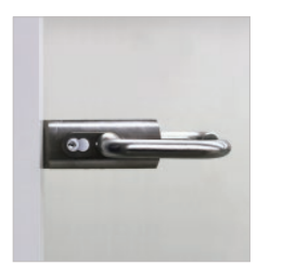
New 90° Patch Lever Set shown with SFIC Lock option. (COM core).