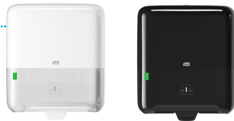
Tork Matic Dispensing System

- Improves hygiene, reduces waste and helps save money with hands-free, controlled-consumption dispensing. Just one less thing to worry about.