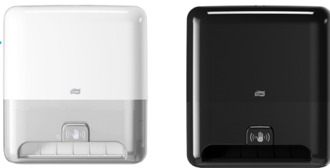
Tork® Matic Hand Towel Roll Dispenser with Intuition Sensor

- One-at-a-time automated dispensing means less towels being used in your restrooms, which means less waste, cost and clutter.