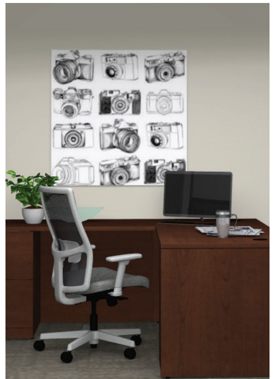
CET Rendering of HON 10500 Series

By utilizing our space planning techniques we can help our clients realize 15-20% savings in operating expenses, while creating an office space that supports employees and inspires innovation.