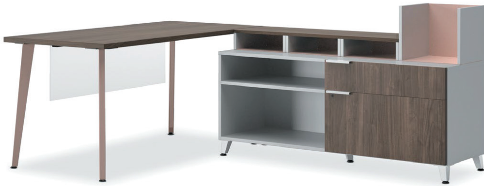
Voi® desk featuring Blossom.