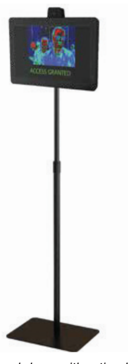
TTS panel shown with optional APS-1 pole stand