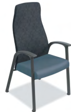
SOOTHE High Back Chair