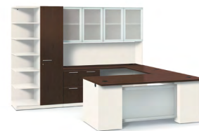
CONCINNITY® Desk & Storage