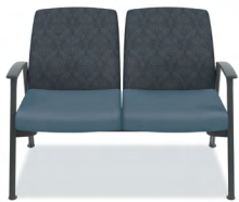
SOOTHE® Tandem Guest Chair