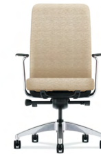
NUCLEUS® Task Chair