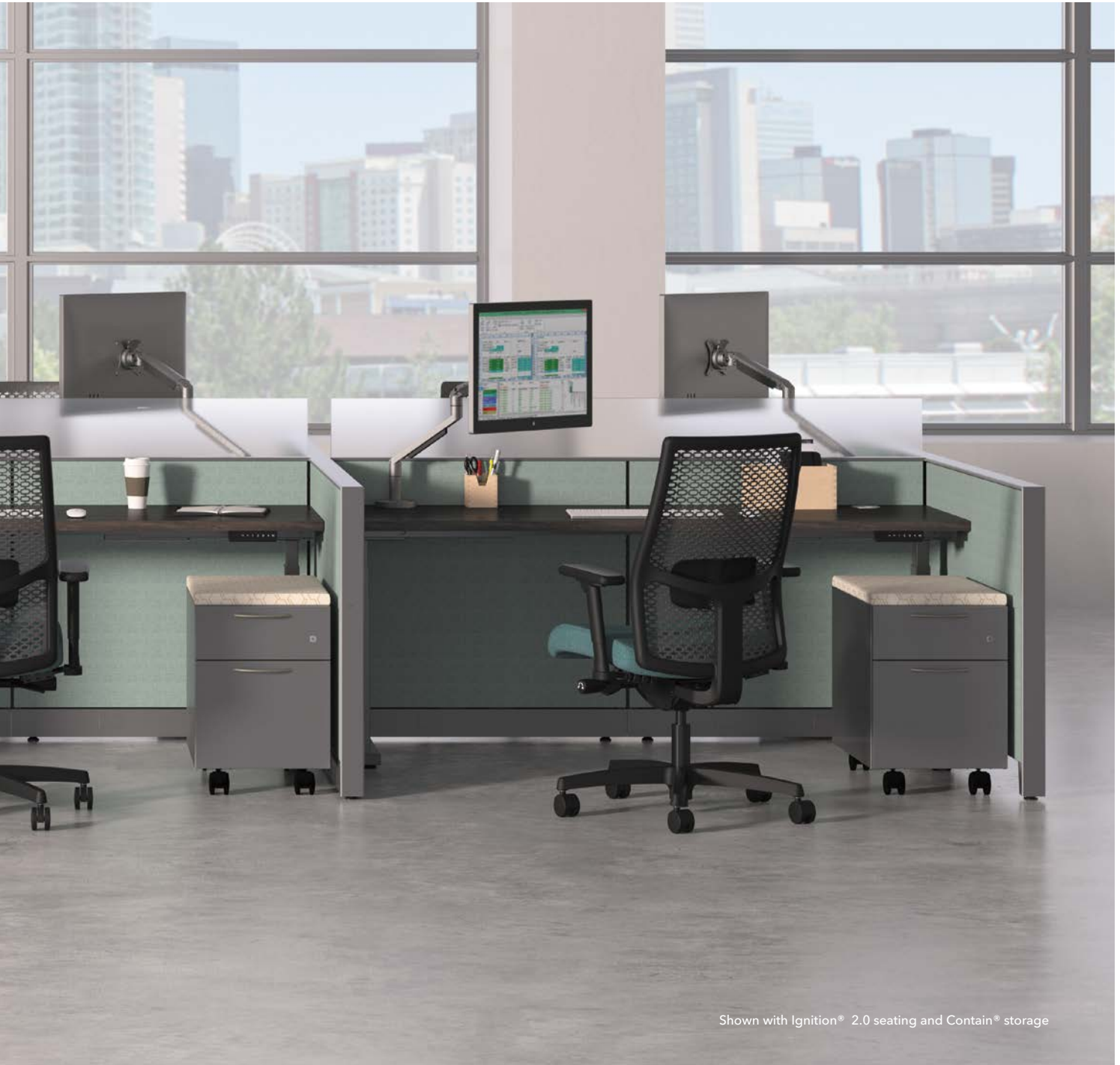
Shown with Ignition® 2.0 seating and Contain® storage

Add variety to your work life with a 2-leg base with a rectangle worksurface or a 3-leg base with a corner cove worksurface that ranges from 24 3/8"H to 47 3/4"H.