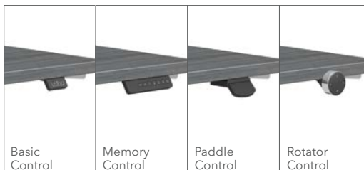
Basic Control Memory Control Paddle Control Rotator Control

Back To The Bases Enhance your office look with the T-Base and C-Base options.