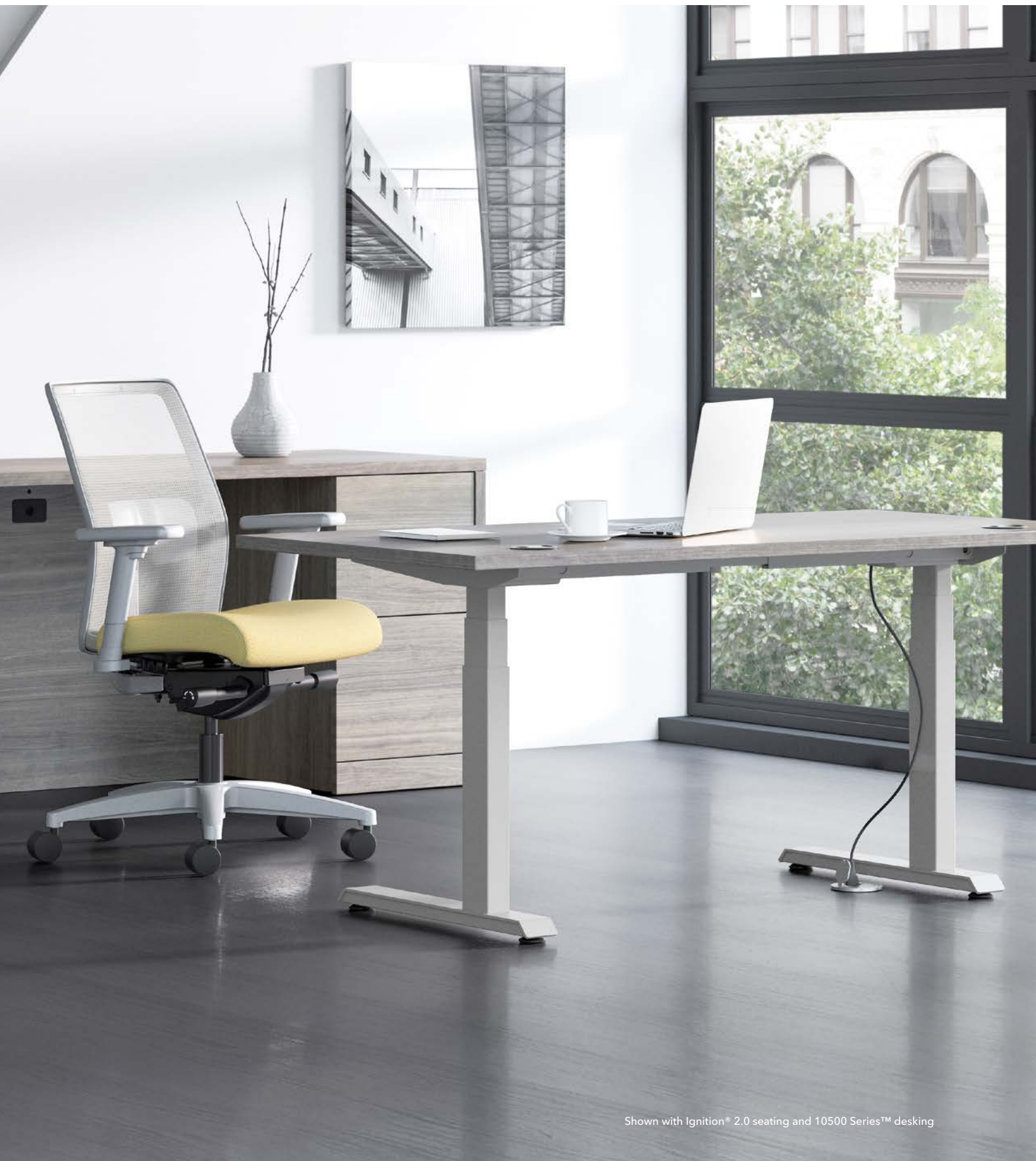
Shown with Ignition® 2.0 seating and 10500 Series™ desking