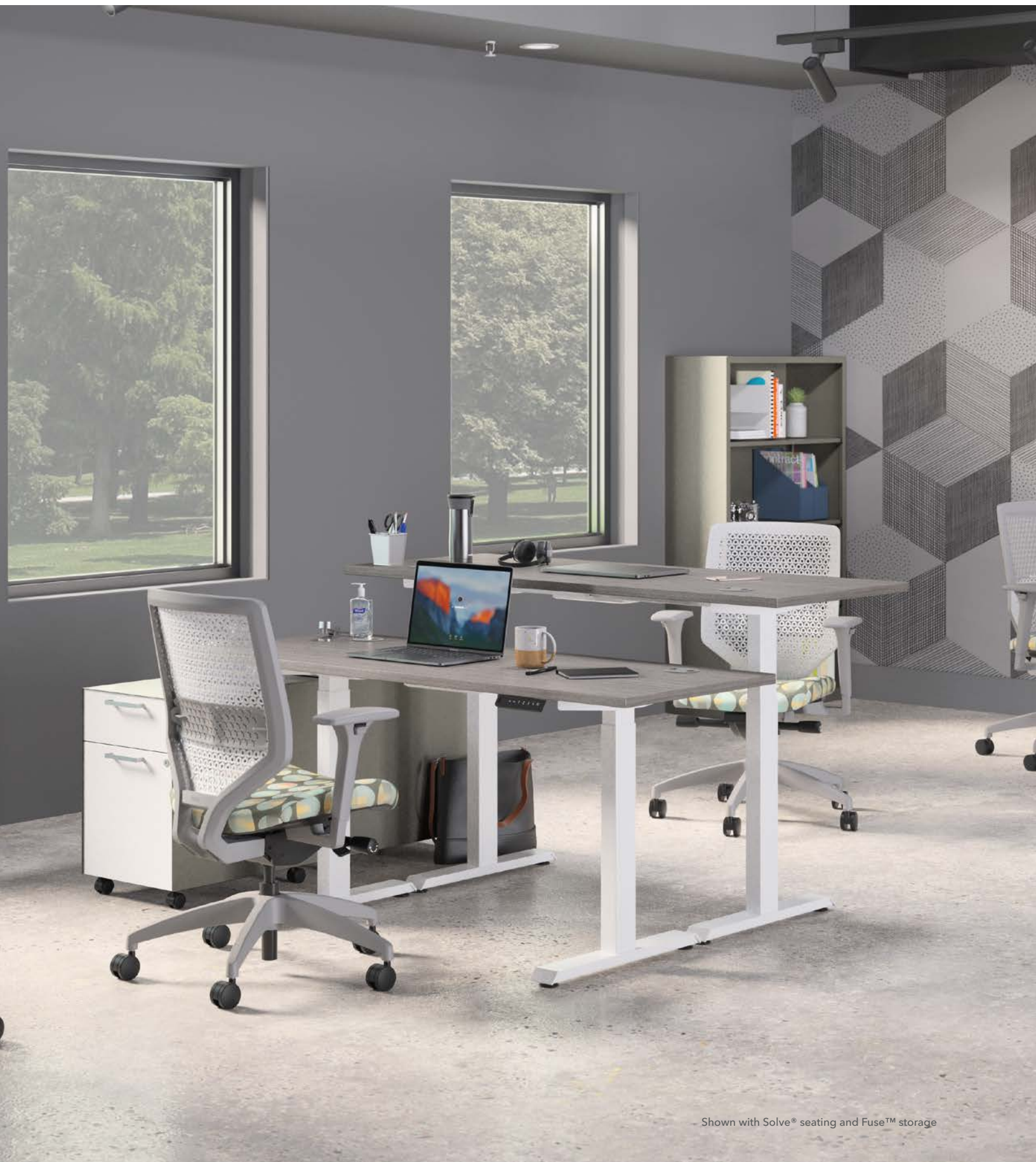
- Shown with Solve® seating and Fuse™ storage