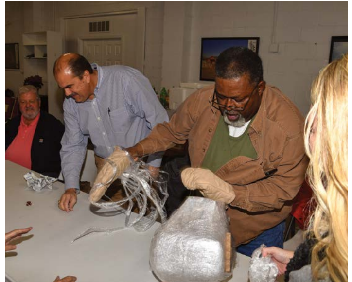
Fun was had by all during the challenging Saran Wrap game!