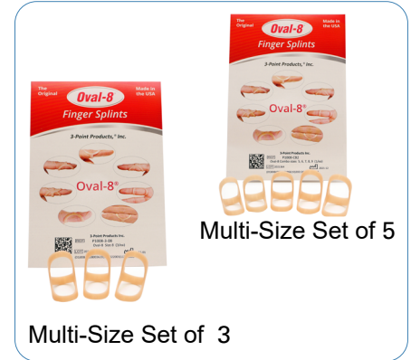
Oval-8 Multi-Size Sets

Choose from Multi Size Sets with 3 consecutive sizes or 5 consecutive sizes provide a mix of sizes for patients whose finger may change over time.