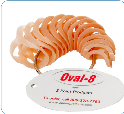
Oval-8 Sizing Set

One each of the 14 Oval-8 sizes. Ideal to size the splints and have patients purchase themselves.