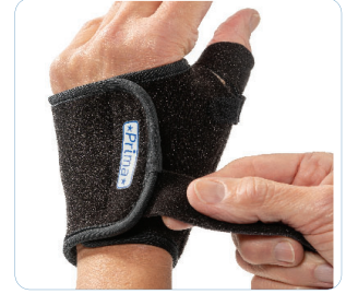
Grasp the strap or the edge of the flap and pull the brace closed