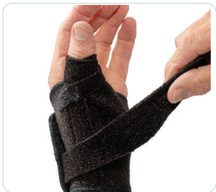
Stretch the strap lightly and bring the strap around the base of your thumb