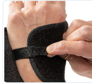
Hold the flap in place as you grasp and attach the Easy-On Tab