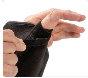
Close the thumb strap with light tension