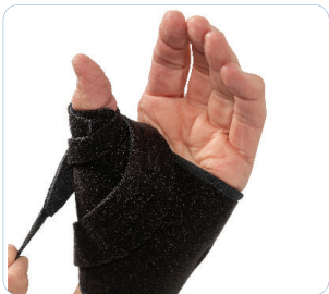
Continue lightly stretching the strap around your thumb and over your web space