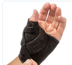
Bring the strap around the base of your thumb and attach the tab