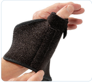
Slide thumb into the brace