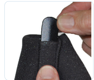
The bendable plastic stay can be removed from the interior pocket as needed